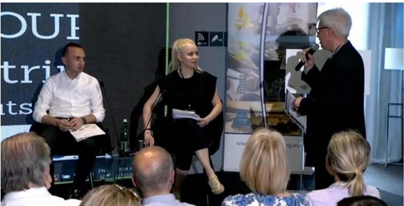
Figure 2: SUSTOURISMO project representatives in the ADRION annual event, 2022.

On 17 May 2022, SUSTOURISMO project was presented during the ADRION annual event that took place within the occasion of the 7th Forum of the EU Strategy for the Adriatic and Ionian Region (EUSAIR) in Tirana (Albania). SUSTOURISMO representatives joined the ‘Panel on Smart and sustainable mobility of Interreg ADRION’s contribution to the EU Green Deal: Experiences of renewables & Energy efficiency and green mobility practices in the Adriatic-Ionian area’ and discussed on the next steps of ADRION connectivity and sustainability. The panel gathered representatives of projects as Inter-Connect (PLUS), TRIBUTE, ENERMOB, and SUSTOURISMO, all co-funded within the Interreg ADRION Programme.