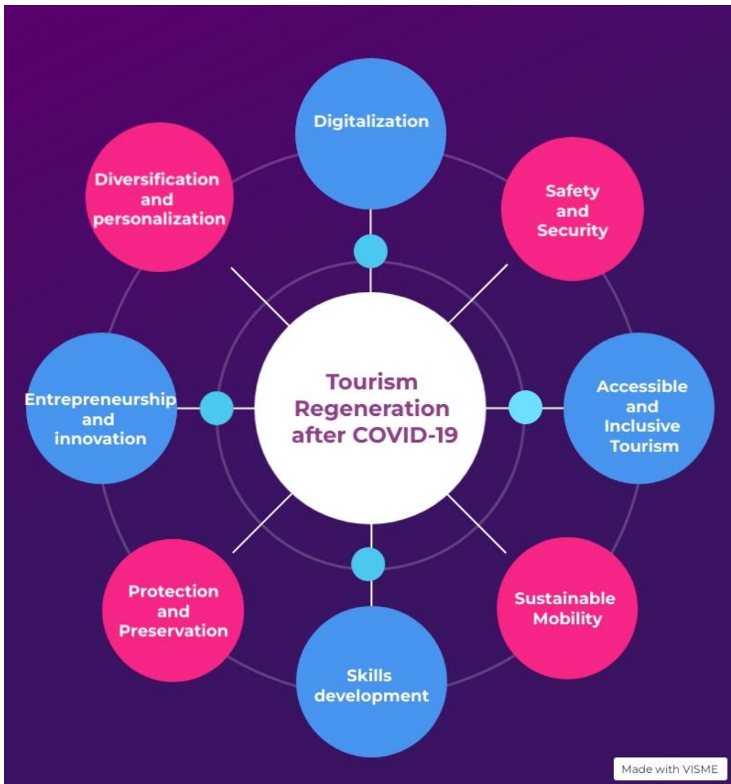
Figure 3: Priorities for tourism regeneration after COVID-19 as derived by the sub-cluster Policy Paper

For further information, policy paper can be downloaded following the link: