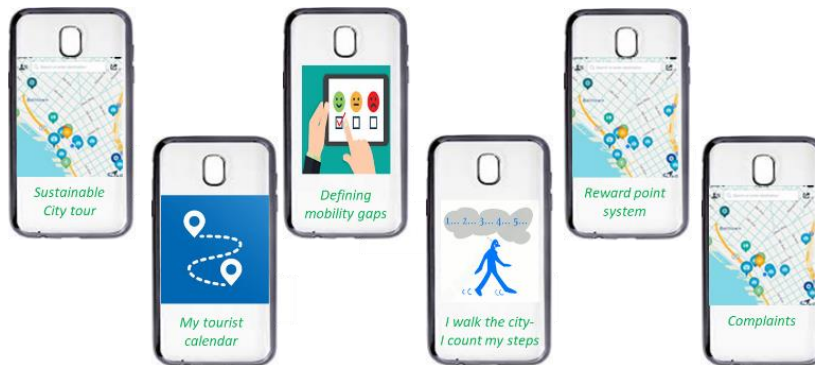
The SUSTOURISMO app functionalities

In order to ensure the best possible exploitation of the application, as well as the promotion of sustainable transport modes within the pilot areas of the project, a rewarding point system will be developed and integrated within the app.