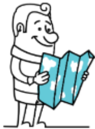
Identify your favorite place