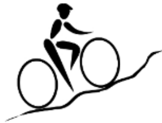
Bike to it