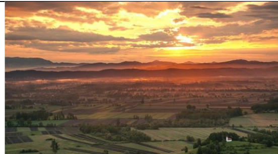
Ljubljana Marshes Nature Park

In Ljubljana, where two different SUSTOURISMO partners join forces, the pilot will focus on improving the attractiveness of the bike & rail path from the main train station to the local national parks, thanks to the valorisation of the sustainable circle around Ljubljana Moors.