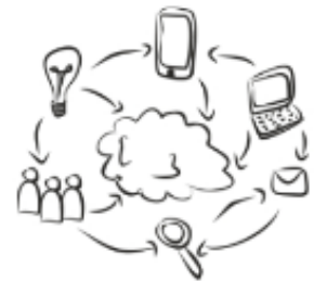
Share & Win