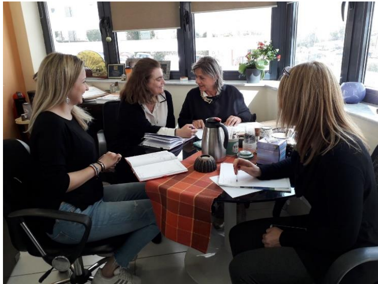
CERTH-PED Epirus meeting

The SUSTOURISMO Kick off Meeting was organized on February, 27 th and 28 th , 2020. Due to the Covid-19 outbreak and all the restrictions imposed for limiting the pandemic spread, the meeting had to be cancelled. Instead, bilateral skype call meetings took place between the Lead Partner and each partner separately, except for the PED Epirus case, as the meeting was held in CERTH's premises. During these meetings, initial ideas about the design and implementation of each pilot case were discussed, in order for all partners to have a common approach and establish strong foundations for the promotion of sustainable tourism via sustainable mobility in their pilot areas. Managerial and financial issues were also discussed and clarified, ensuring therefore that crucial issues for the project's upright implementation will be taken into account by all partners throughout the project's duration.